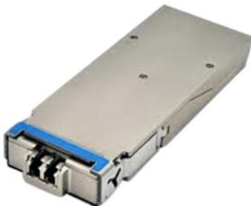
Figure 2. CFP2-ACO Based Trunk Optics